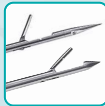
Conical or pyramidal tip available