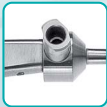
LuerLock flush port

300-152-000 sharp conical tip only, package with 5 pieces