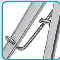
Self closing spring mechanism