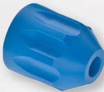
| 300-661-008 Color: blue