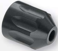
| 300-661-005 Color: black

Add more efficiency and safety to your detachable laparoscopic Instruments by categorizing individually with the all-new RZ color coded locking nuts*.