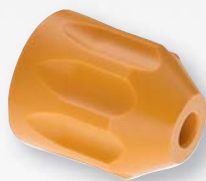
| 300-661-009 Color: yellow for 3.5mm Mini Laparoscopy