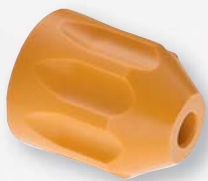
| 300-661-004 Color: yellow