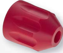
| 300-661-006 Color: red