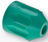
| 300-661-007 Color: green