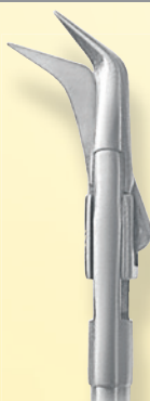
252-800-007 45° angled, sharp, single action