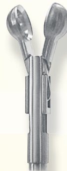
252-804-005 sharp, Ø 5mm